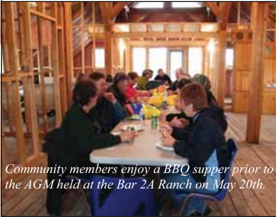
Community members enjoy a BBQ supper prior to the AGM held at the Bar 2A Ranch on May 20th.