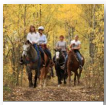
WCFA Board members and guests enjoyed a scenic ride in the Peace River Valley on September 25<sup>th</sup>, 2010

Through the cooperative efforts of WOLF and AFEX, the WCFA was able to offer a Forest Stewardship course in February 2011. Unfortunately, there was not enough interest to meet the minimum 20 people required to cover the material costs of delivering the course.